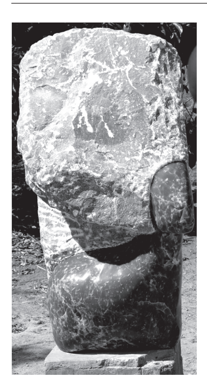
Fig. 7. The Judge , Lazarus Takawira, leopoldite.

The issue of heritage raised in the above quote is very important to Lazarus Takawira. In Bathing , he refers to traditional Shona customs, such as bathing in the river. Issues related to local beliefs are also a frequent theme of his works. This is the case with Tsuro's work, which formally depicts a rabbit curled up. However, the sculpture has a second meaning – a key theme in Shona beliefs – the rabbit represents the spirit of a deceased ancestor. The viewer has the impression that he or she sees a rabbit endowed with a magical aura. The characteristic pose of the rabbit curled up in a ball suggests a metamorphosis, a transition from one being to another. Lazarus Takawira, despite being a Christian, is a eulogist of the traditional values, lifestyle and beliefs of his people. It is very sad that the younger generations are departing from tradition: they don't know our legends anymore, they don't drink Chibuku, they drink this new beer in large bottles, Scud. They don't know that a cow gives milk (...).<sup>44</sup>